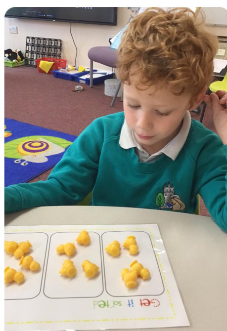
Grouping and sharing